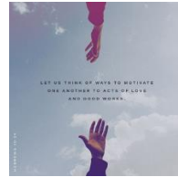
4 (2 votes)