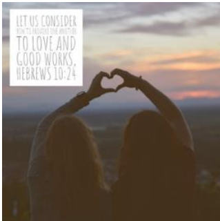
6 (34 votes)