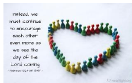
2 (5 votes)