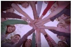
1 (1 vote)

Thank you to everyone who voted to choose a picture to capture our school Bible verse. The votes were as follows: