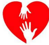
3 (2 votes)