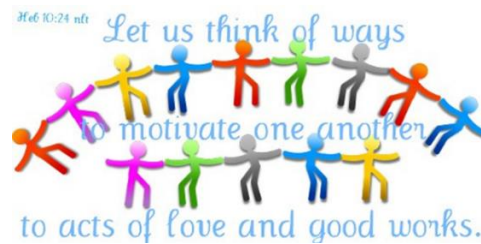
7 (0 votes)

Picture 6 was the outstanding winner. Pupils were asked not to discuss the outcome until Mrs Bloomer had spoken with Mrs Winterburn. Once finalised, we will then think about how we can create a picture like this of our own.