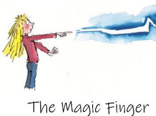
The Magic Finger