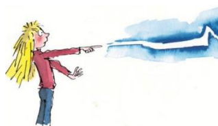
The Magic Finger