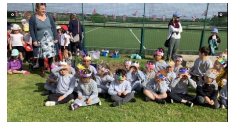
(see Tapestry for more details). We

are also looking forward to our new outside water area equipment arriving and keeping an eye on out for our potatoes coming up in the raised beds all ready for our GROWING TOPIC. Have a wonderfully relaxing May half-term break and enjoy your Jubilee Bank Holiday weekend.